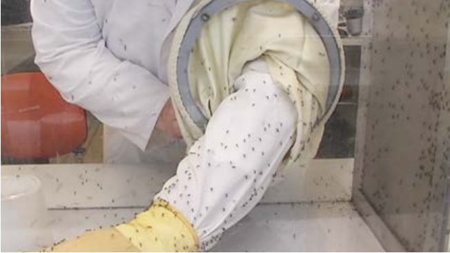
Without Insect Proof

To get registered, the safety and effectiveness of our product have been carefully tested. The 'arm in cage test', for example, shows how mosquitos stay away from clothing impregnated with permethrin, and what's more don't sting the person tested.