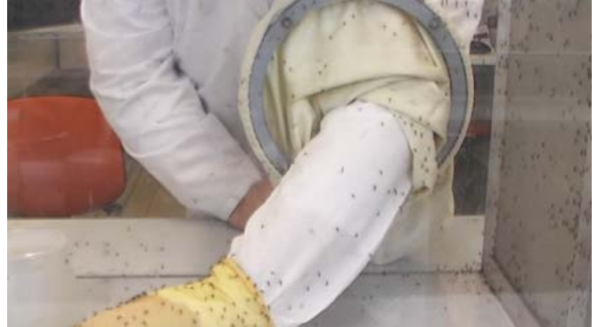
With Insect Proof